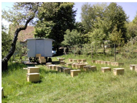
Farmstead of Papp V.V. Specialization of it is the reproduction and research of the Carpathian bee.